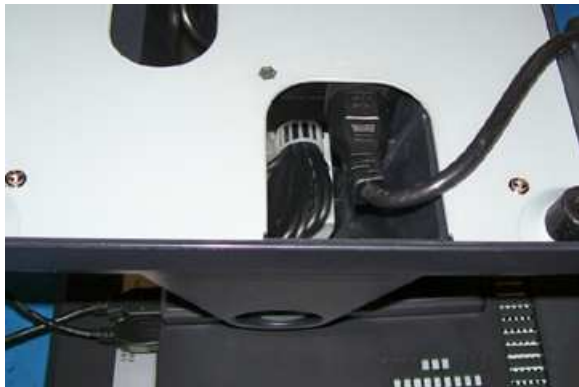
Figure 1, 2170 Power Cord Attachment

WARNING: To avoid accidental power-up during installation, connect the AC Power Cable last.