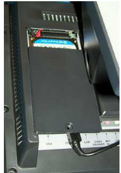
Figure 4, 2170 HDD seen under open door